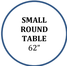
TABLE & CHAIR OPTIONS