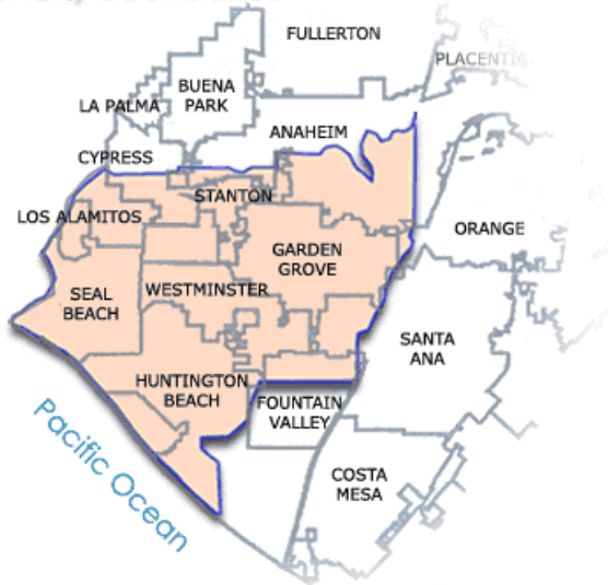
Westminster Watershed & City Boundaries