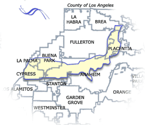
Carbon Creek Watershed & City Boundaries