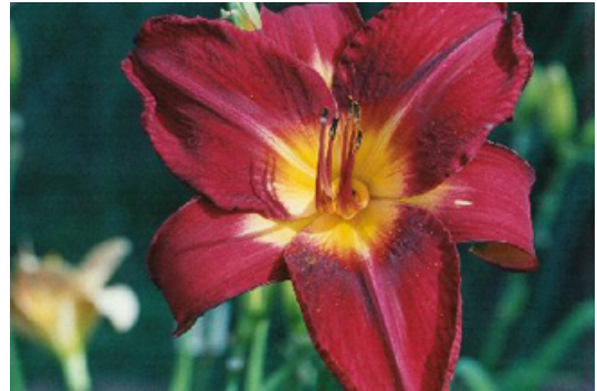
Red Daylily ( Hemerocallis flava )

The Douglass Road street landscape will consist of a double row of Mexican Fan Palms in the parkway and setback areas. The median will not be landscaped to allow for better traffic flow in and out of Arrowhead Pond of Anaheim and Angel Stadium of Anaheim. Yellow Trumpet or similar vines will be attached to the base of the palm trunks and red Daylilies or a similar low red flowering shrub will be planted in the parkway.