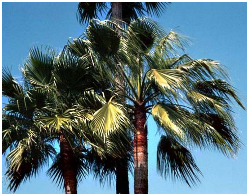
Mexican Fan Palm ( Washingtonia robusta )