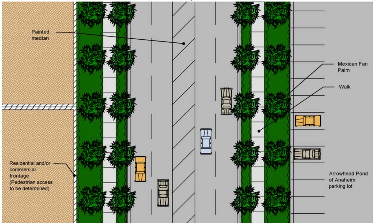
Figure 26: Douglass Road