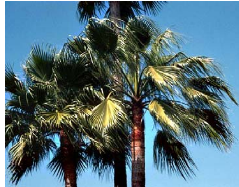
Mexican Fan Palm ( Washingtonia robusta )