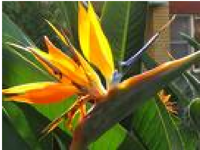
Bird of Paradise ( Strelitzia reginae )

To provide for pedestrian circulation a 7½ -foot wide sidewalk within the public right-of-way is required with 2½ foot by 2½ foot scoring. Adjacent to this sidewalk, the setback area, may be paved and/or landscaped and outdoor restaurant seating area may encroach into this area.