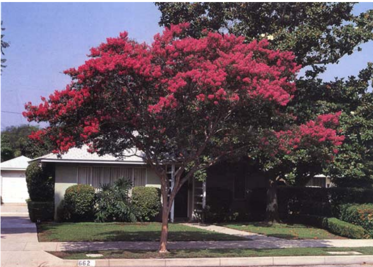
Crape Myrtle Tree ( Lagerstroemia indica )