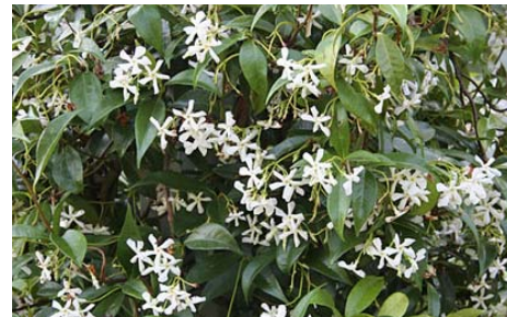
Star Jasmine ( Trachelospermum jasminoides )