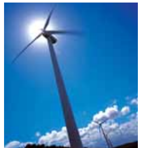
Renewable resources such as wind power help to ensure a diverse mix of power generation and enable us to keep rates low and service reliable.

We also continue to explore a variety of research, development and demonstration projects, such as our thermal energy storage system, which provides air conditioning using off-peak energy to create ice as a cooling medium. Our fuel cell generator project converts natural gas directly into electricity through a chemical reaction. Our commitment is to continue to evaluate new technologies that help deliver the highest level of service to our customers.