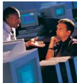
Anaheim Public Utilities has been a key player in Anaheim's business and economic development, helping to attract or retain more than 21,000 jobs over the past 12 years.