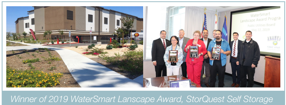
Winner of 2019 WaterSmart Landscape Award, StorQuest Self Storage